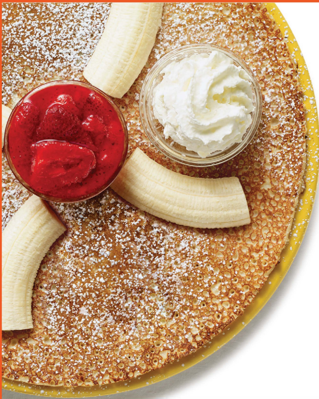
#11 BANANA, STRAWBERRY & WHIP