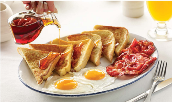
CANUCK FRENCH TOAST

CANUCK DeBakon* and eggs made with Cobs French Bread. 20.66