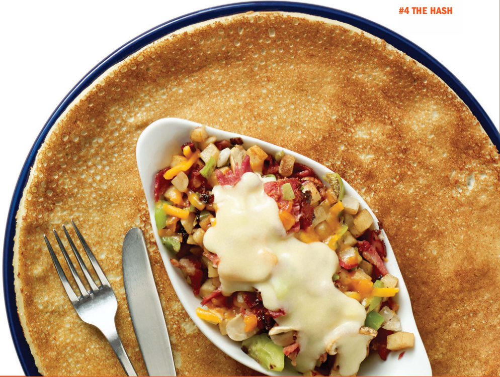
#4 THE HASH

We understand. It's hard to choose between so many delicious pannekoek flavours. If you're looking to try more than one, we suggest ordering our smaller klein sized pannekoek as we cannot accommodate half and half orders.