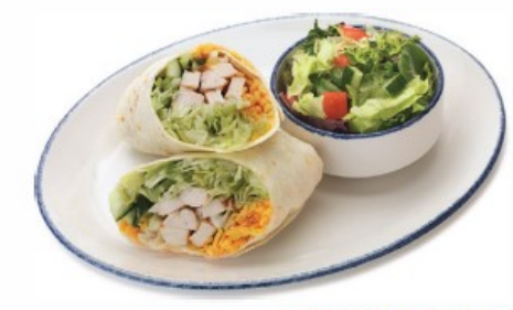
CHICKEN & CUCUMBER WRAP

CHICKEN QUESADILLA Chicken breast, green pepper, onion, Dutch cheese, cheddar, sour cream and salsa.