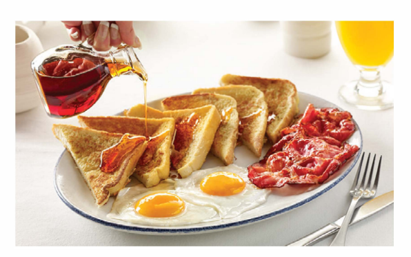
CANUCK FRENCH TOAST

CANUCK DeBakon* and eggs made with Cobs French Bread. 20.66