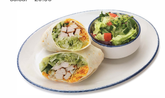
CHICKEN & CUCUMBER WRAP