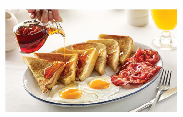
CANUCK FRENCH TOAST

CANUCK DeBakon* and eggs made with Cobs French Bread. 20.66