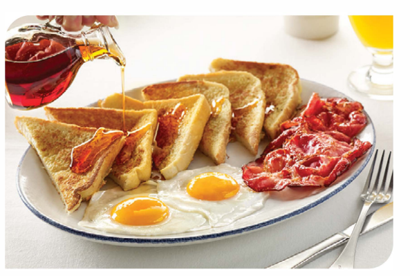
CANUCK FRENCH TOAST

CANUCK DeBakon* and eggs made with Cobs French Bread. 21.07