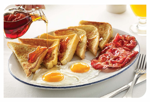
CANUCK FRENCH TOAST

CANUCK DeBakon* and eggs made with Cobs French Bread. 21.07