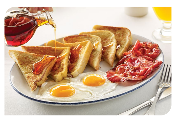
CANUCK FRENCH TOAST

CANUCK DeBakon* and eggs made with Cobs French Bread. 20.66