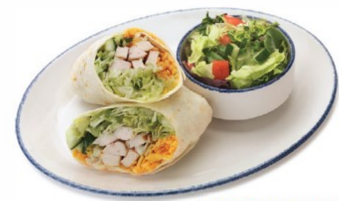
CHICKEN & CUCUMBER WRAP

CHICKEN QUESADILLA Chicken breast, green pepper, onion, Dutch cheese, cheddar, sour cream and salsa. 21.91