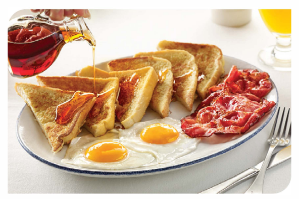
CANUCK FRENCH TOAST

CANUCK DeBakon* and eggs made with Cobs French Bread. 21.60